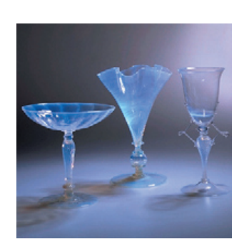
Wine glass Britain Made by James Powell & Sons, Whitefriars Glassworks, London 1876

The V&A holds the National Collection of Glass. It includes more than 6000 pieces, from the Middle East, Europe and America, and illustrates the 4000-year history of glass, from the 2nd millennium BC to the present day. Displayed alongside glass of many techniques and ages, the Arts and Crafts glass stands out as for its fluid, natural forms.