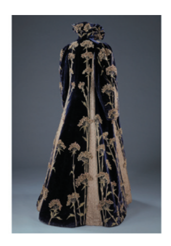
Robe Britain or France About 1900 Embroidered velvet, with satin and lace Museum no. T.49-1962

The V&A collection covers fashionable dress from the 17th century to the present day, with the emphasis on progressive and influential designs from the major fashion centres of Europe. Dress reform was a trend that ran parallel with the Arts and Crafts Movement. In an effort to free women from corsetry, it advocated a radically new approach to dress, examples of which can be seen in these newly refurbished galleries.